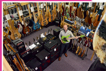
Mayones - Jabba custom 5